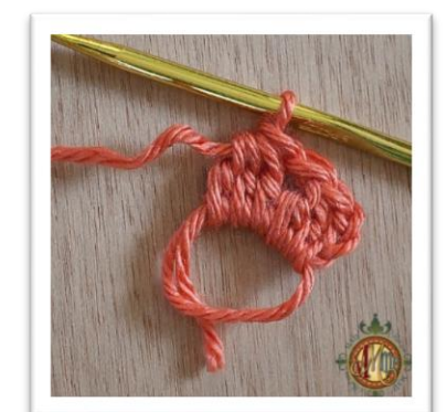
Two Dc3tog complete, chain3