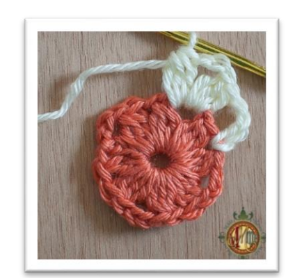
In next space:*Dc3tog, ch3, Dc3tog, ch3