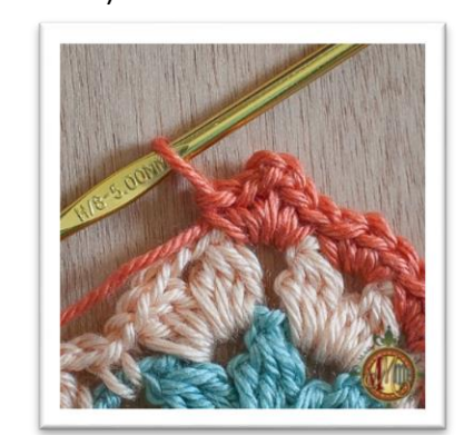
CORNERS: In each corner sc2, ch2, sc2. Repeat sc pattern around. Join with sl st to beginning of row. Finish off, weave in ends.