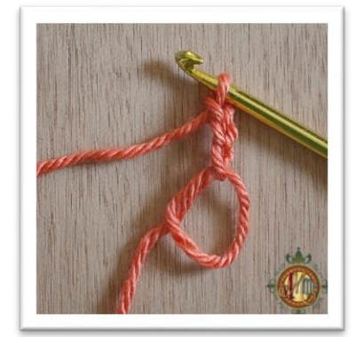
Chain 3 (this will be the beginning of your Dc3tog)