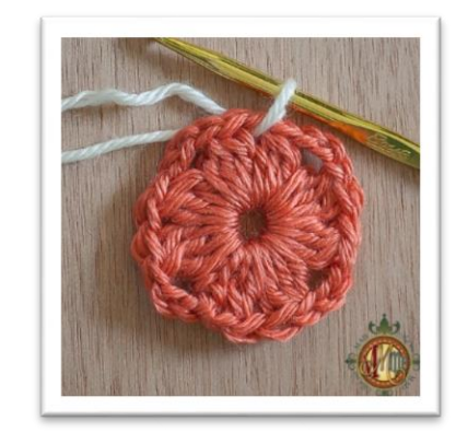
Row 2-Join new yarn in any ch1 then ch3