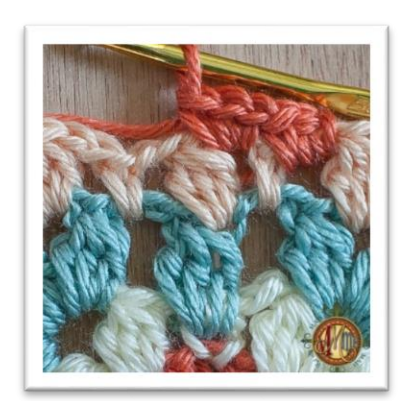
Join next yarn with sl st to any sp, ch1, sc2 in same sp. Sc3 in each space around EXCEPT CORNERS.