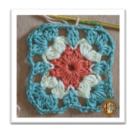
Row 4-Join new yarn INTO TOP<sup>Tip 2</sup> of Dc3tog (see Tip 2 below)