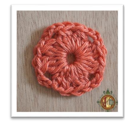
Join with sl st to beginning of row. Finish off, weave in ends.