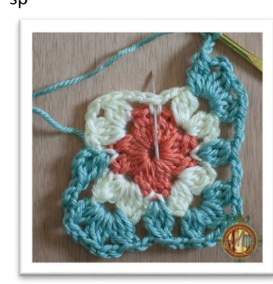
hook (pic 1) and the backside where your hook should come