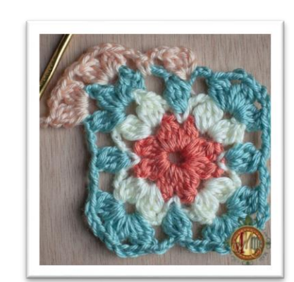
In nxt two sps Dc3tog, ch2, Dc3tog, ch2. Sc into nxt sp, ch2.