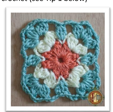
Join with sl st to beginning of row. Finish off, weave in ends.