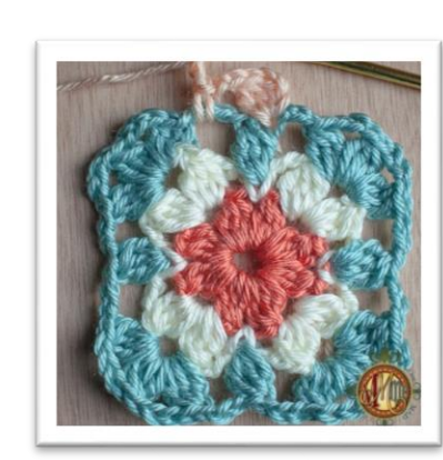
Ch3, Dc2tog, ch2 (counts as *Dc3tog plus ch2), sc into next