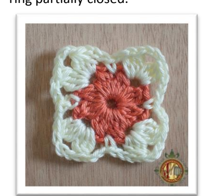
Finish off, weave in ends.