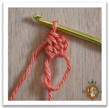
YO and pull through all three loops. (First Dc3tog complete)