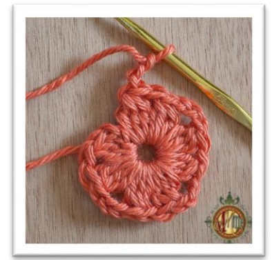
Create three more *Dc3tog, ch1, Dc3tog, ch3* in ring. Pull adj ring partially closed.