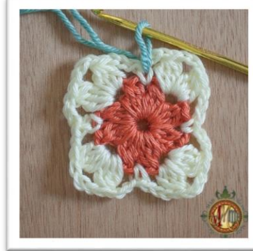
Row 3-Join new yarn INTO MIDDLE of any sc of previous