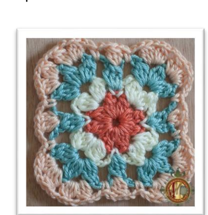
Repeat from *around. Join with sl st to beginning of row. Finish off, weave in ends.