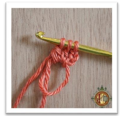
Dc2tog (ch3 plus Dc2tog counts as Dc3tog)