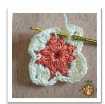
Sc in ch1 sp, ch3. Repeat from *around, join with sl st INTO<sup>Tip 1</sup> the middle of the first single crochet (see Tip 1 below)