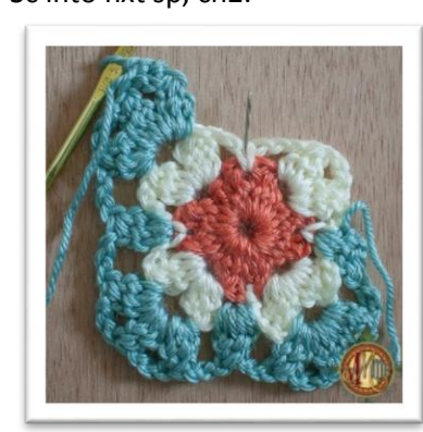
\emph{Tip 2} ext{-} The sewing needle indicates "INTO TOP" as stated above. This is where you will insert your hook to create the side Dc3togs in Row 4.