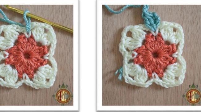
Ch 3, Dc2tog, ch 3 (counts as *Dc3tog plus ch3 in sc)