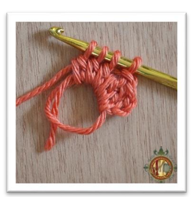
Ch1 do another Dc3tog in ring