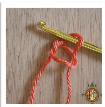
Row 1-Start with an adjustable ring. Slip stitch in ring.

The scalloped edges provide an opportunity to use unique joining techniques. Enjoy!