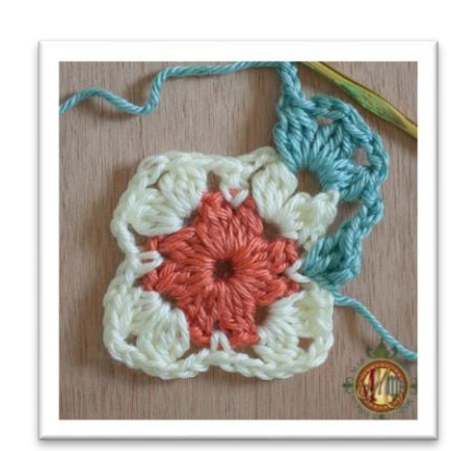
In corner sp: Dc3tog, ch3, Dc3tog, ch3, Dc3tog, ch3 Repeat from *around.